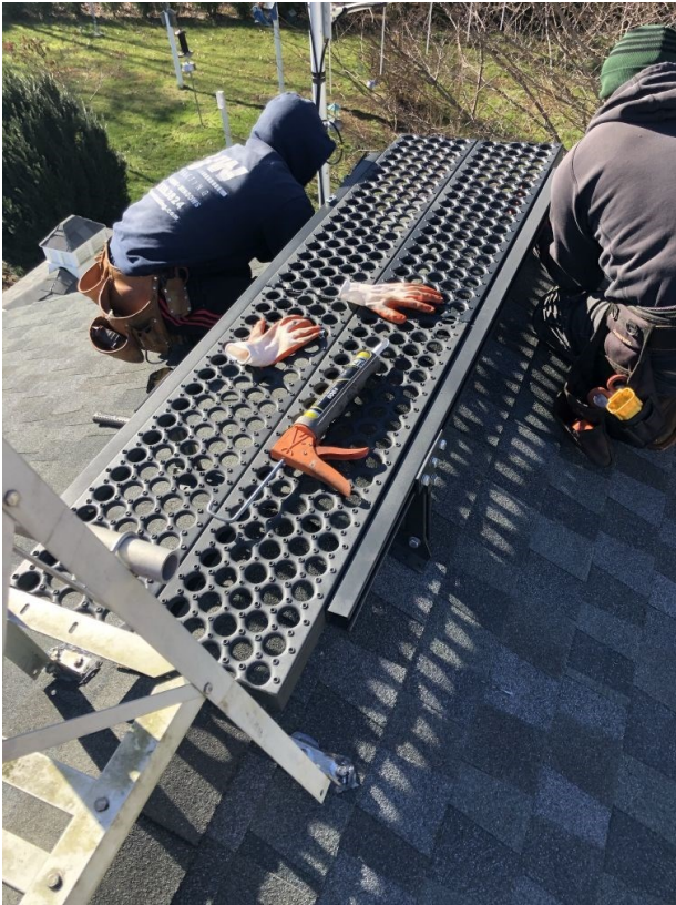
Contractor Installing Rooftop Platform