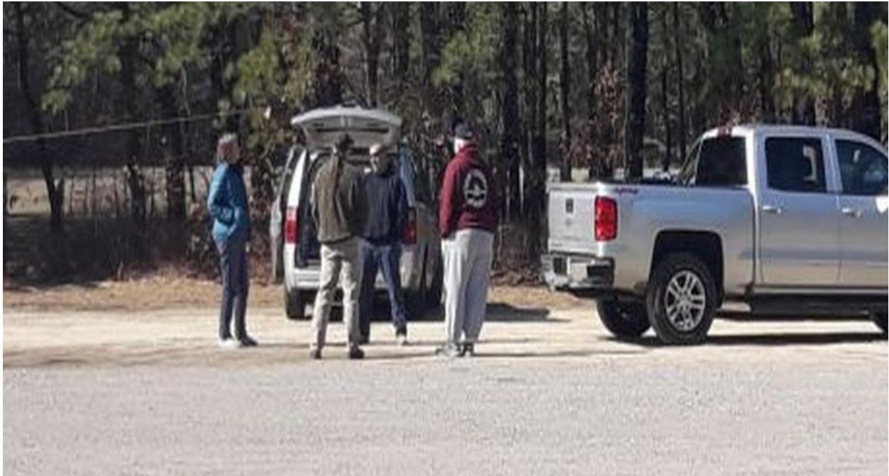
KC2ENS, NJ2N, KB2RUV and KC2SBR