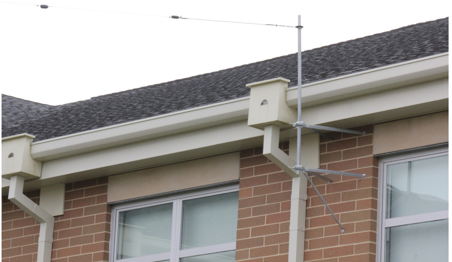
Mounting bracket for the HF dipole antenna at Southern Regional High School