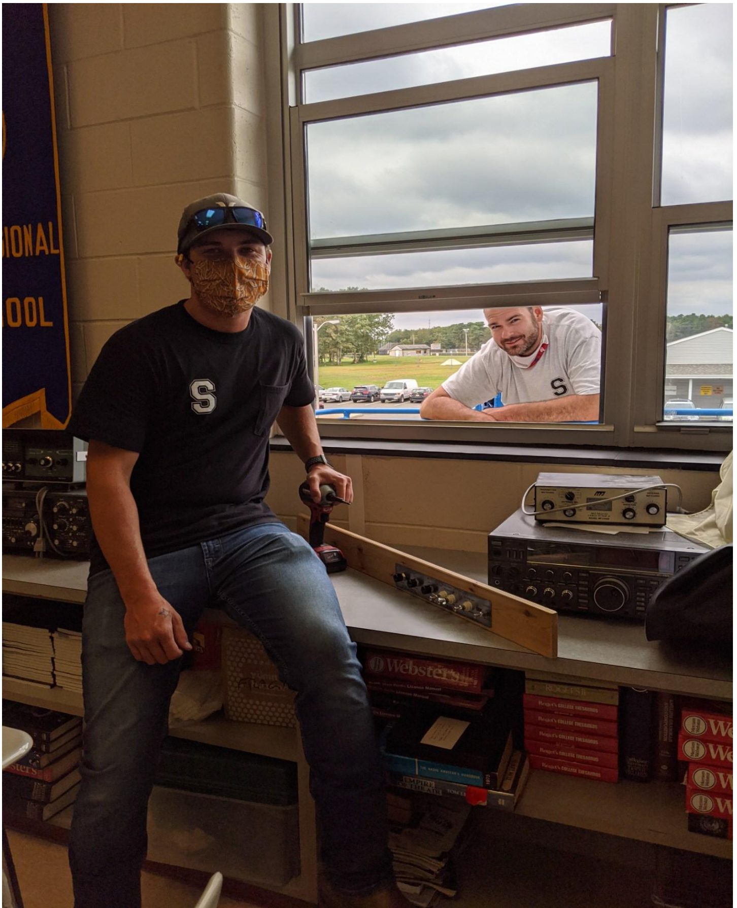
Classroom view of antenna installation at Southern Regional High School