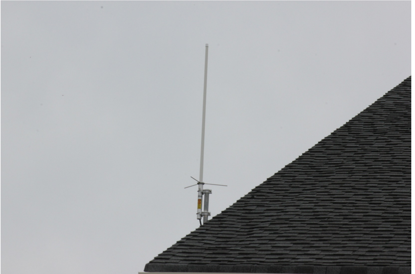
VHF/UHF antenna for Southern Regional High School antenna project