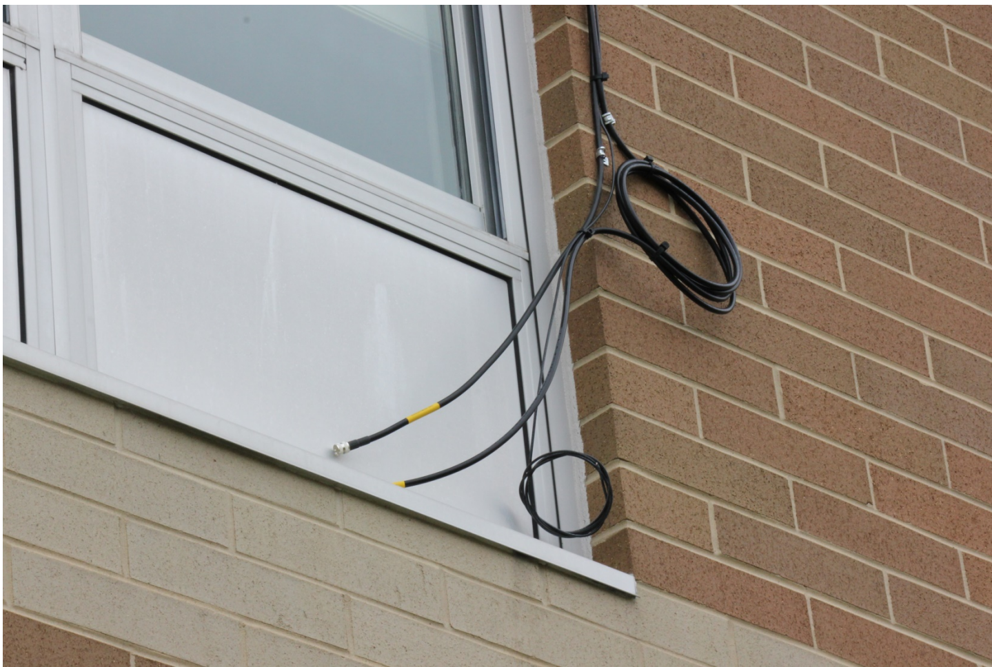
Coax and ground wire for the classroom antennas at Southern Regional High School