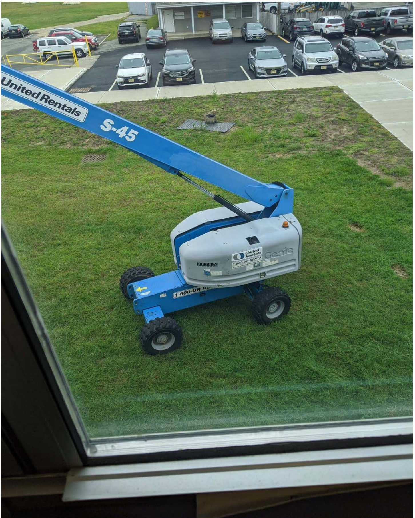
View of high-low equipment for antenna installation at Southern Regional High School